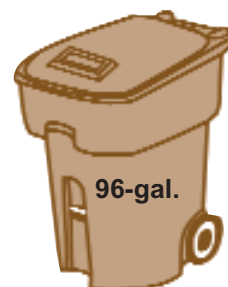
Weekly yard debris