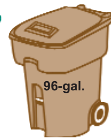
Weekly yard debris