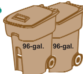
Weekly yard debris