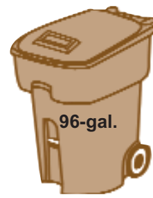
Weekly yard debris